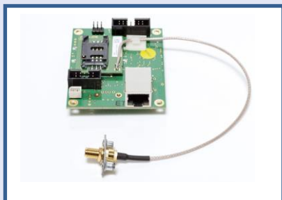
Web server – Web server + GSM